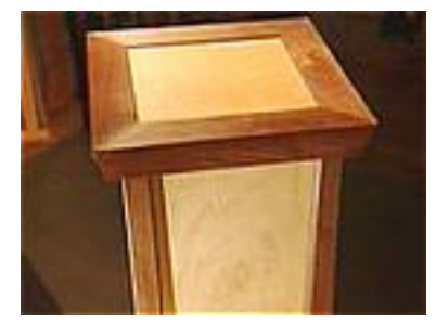
The black-walnut detailing of the top, base and corner trim provides a rich contrast to the golden maple of the cabinet.