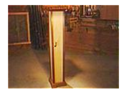
The maple and walnut CD case adds a bit of class to a functional accessory.